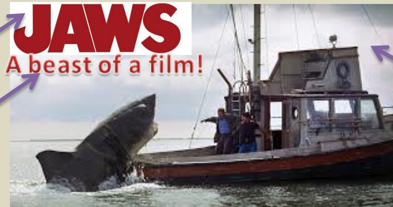
Image from the film (draw a box at first, then add this in later if you have time)

Key information in bullet points: director, actors, length, date of release, etc