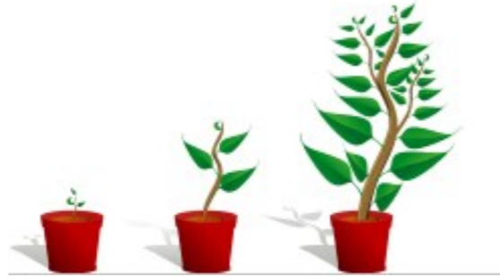
Observing over Time