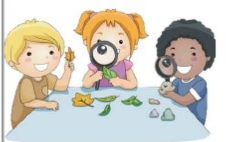
Identifying and Classifying