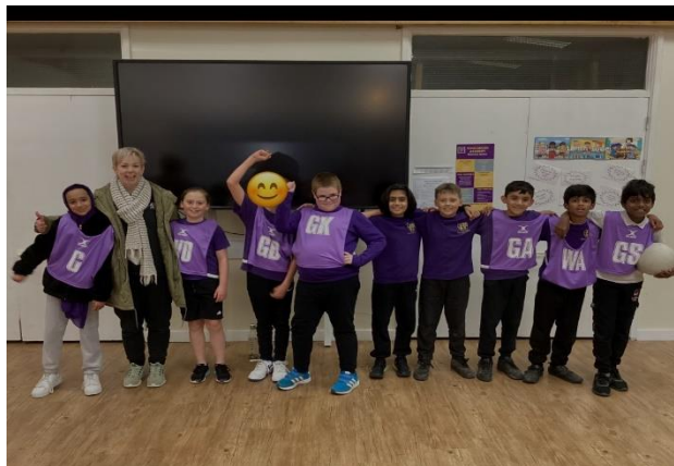
Our amazing netball team! Best Ivingswood team EVER!

All classes have also used the climbing apparatus in the hall, helping to develop their upper body strength as well as some of the other gym equipment. We were able to complete a pike and tuck jump and then land safely.